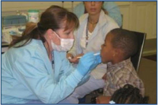
Dental screening for all Head Start children in the program.